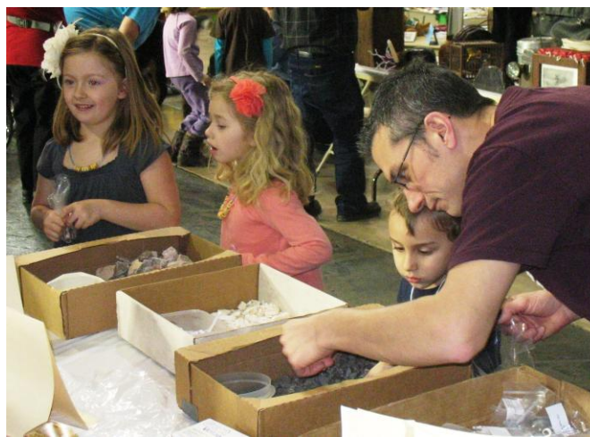
Future rockhounds at Kaleidoscope 2013