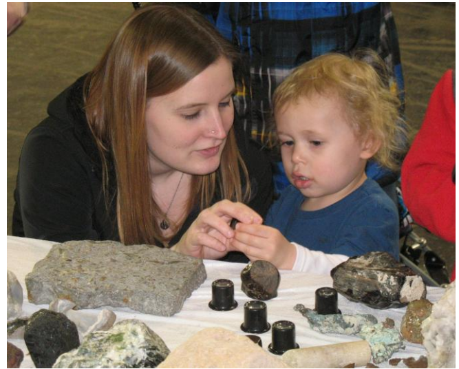
A budding rockhound at Kaleidoscope 2013